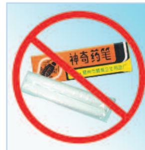
Illegal insecticide chalk.

Miraculous Chalk or Chinese Chalk, is usually imported from China and is not expensive. It looks like simple blackboard chalk.