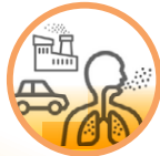
air pollution and respiratory problems