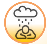
mental health effects