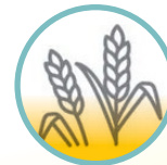
alteration in plant growth and distribution