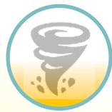
changes in weather

Children depend on adults to keep them healthy and protect them from the physical and psychological effects of extreme weather.