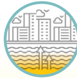
rising sea level