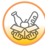
worsened food quality and access